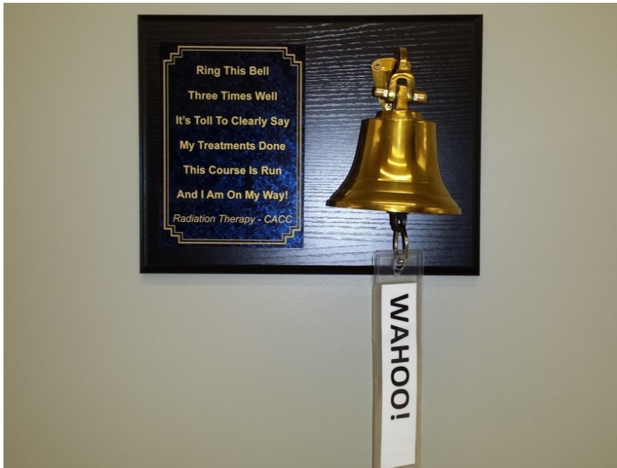
End of treatment bell at the Central Alberta Cancer Centre